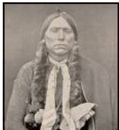
Quanah Parker

The prevailing military philosophy was to break the people's will to resist by destroying their ability to feed and supply themselves. Another military approach was to conduct winter campaigns against the Indians, who found their teepees and provisions destroyed.