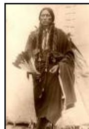
Quanah Parker

The last large military campaign and the Comanches' last sustained effort to hold on to their old way of life occurred in 1874. Quanah Parker chose to assault buffalo hunters encamped at Adobe Walls, but was defeated. In 1874 Col. Ranald S. Mackenzie led his command into Palo Duro Canyon and destroyed five Comanche villages. By winter 1875, the last small bands led by Quanah Parker came to Ft. Sill, Oklahoma reservation, hungry and defeated.